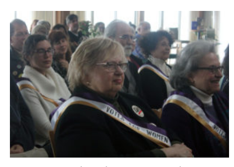
Event attendees listen to speakers discuss the importance of Shoreham during the suffrage movement.

"We'll be applying for the grants each year, so if we can average two to three sites a year, in six years, we'll have enough to make a map and that'll be when we'll finally have a complete trail," Furfaro said.